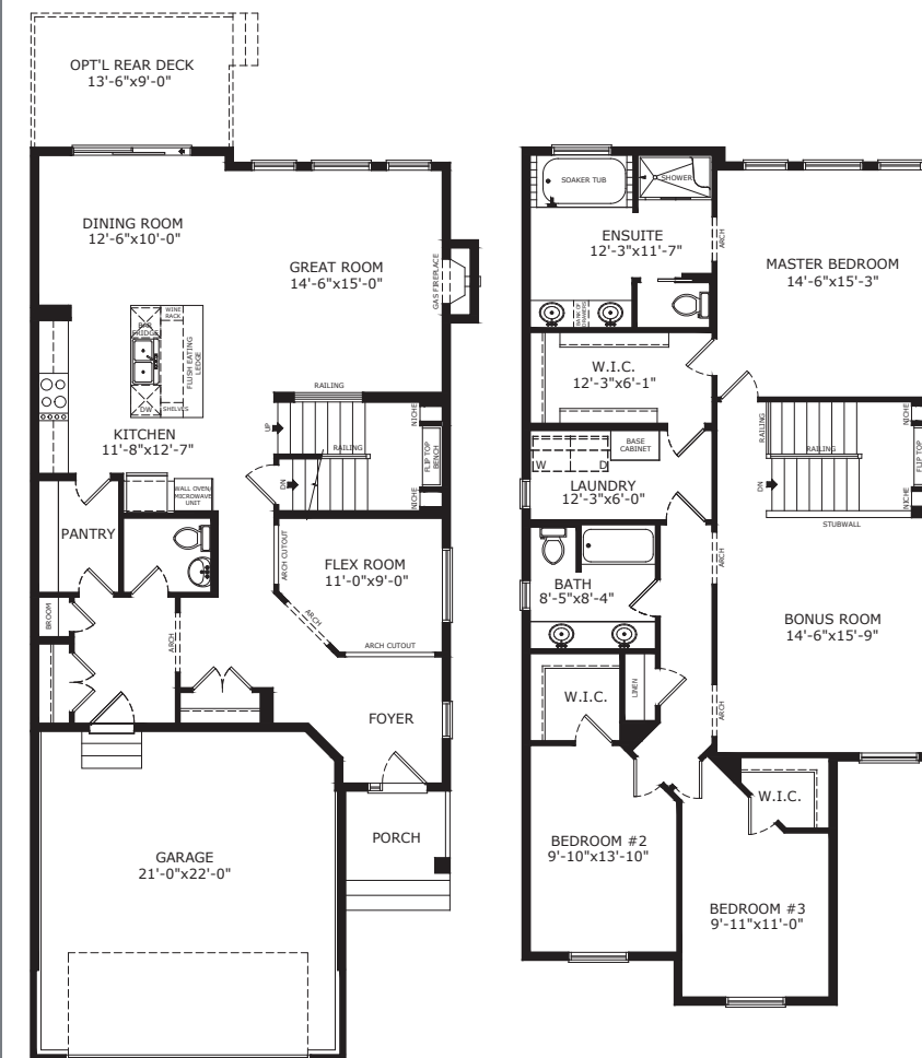
Optional Executive Kitchen Layout