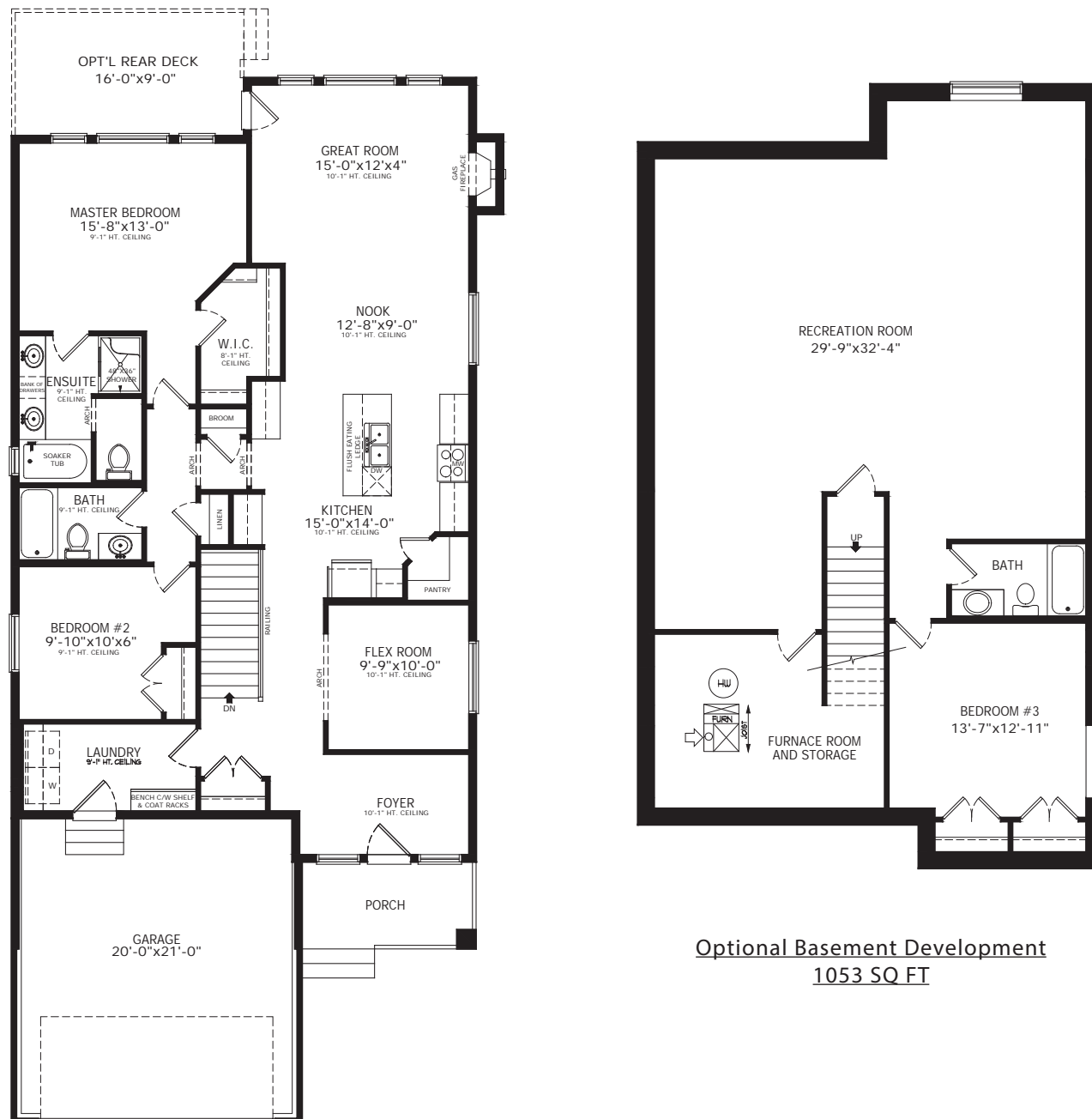
Optional Basement Development 1053 SQ FT