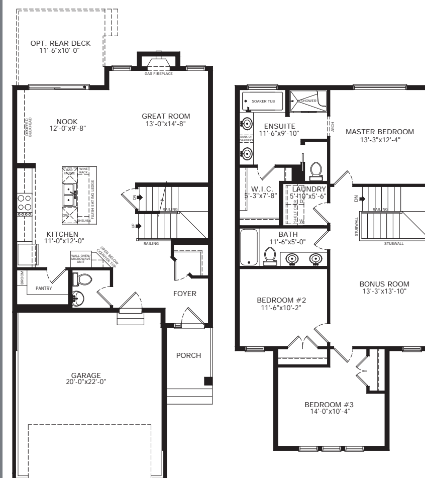
Optional Executive Kitchen Layout